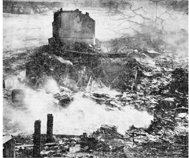
A LANDMARK GOES DOWN—These smoking ruins were all that remained yesterday of the old Albany Country Clubhouse off Western Avenue. The clubhouse, with only a section of the kitchen chimney standing, was razed to prepare the site of the new campus of the State College at Albany.

This included the deliberate burning of the Clubhouse - Knickerbocker News clip from 14 February 1963