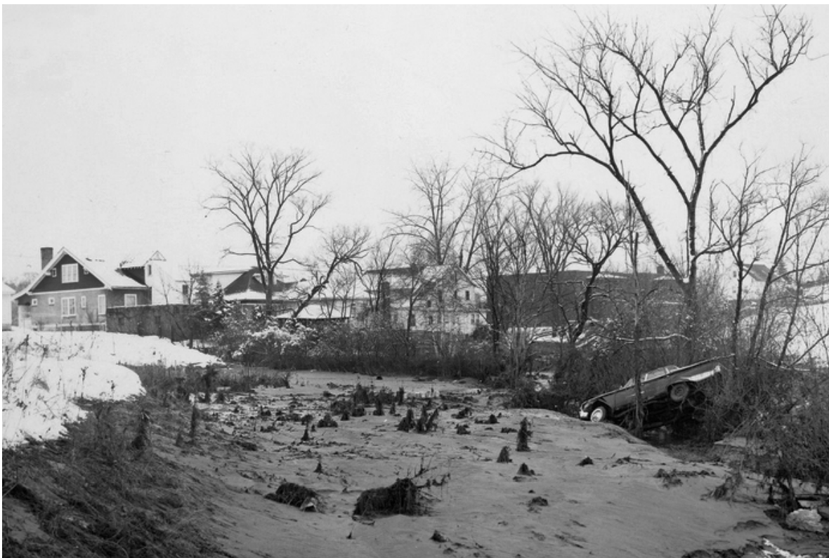
View upstream towards the houses on Western Avenue after the flood 21 March 1963

and perhaps not entirely accidental, but from failure to regulate the water level, the ~65-year old dam on the pond collapsed 21 March 1963 during the early spring thaw; the flood of mud and water that resulted poured over Western Avenue and into the valley of the Krum Kill, carrying a car with it.