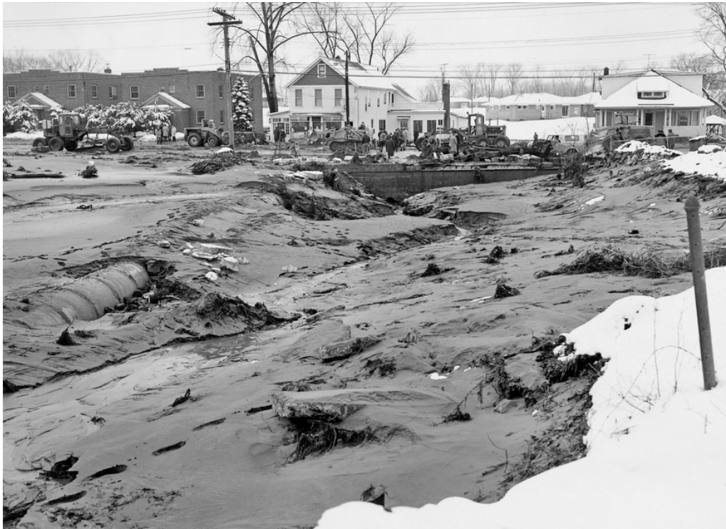
View downstream towards Western Avenue of the flood-scoured drain pipe and channel of the Krum Kill east branch, 21 March 1963