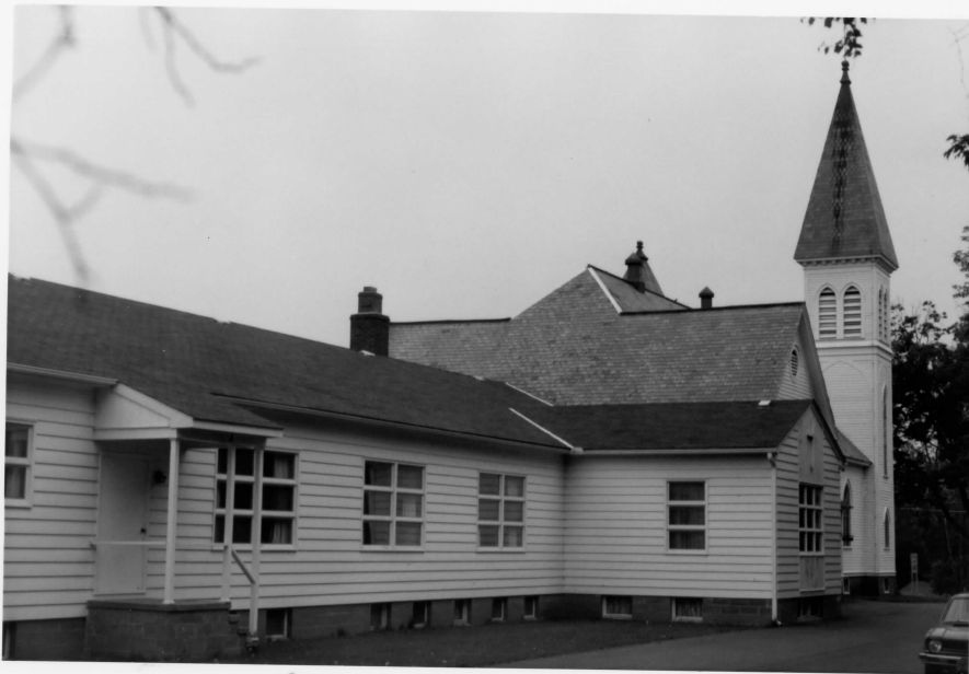
Sunday school addition on northern end looking south

HELDERBERG REFORMED DUTCH CHURCH Historic Resources of Guilderland (Phase I) Guilderland, New York Albany County Building #8